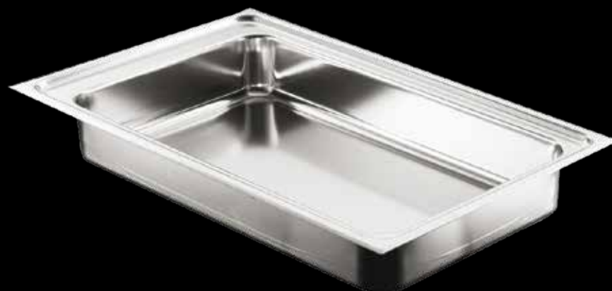
FRY TOP 1/1