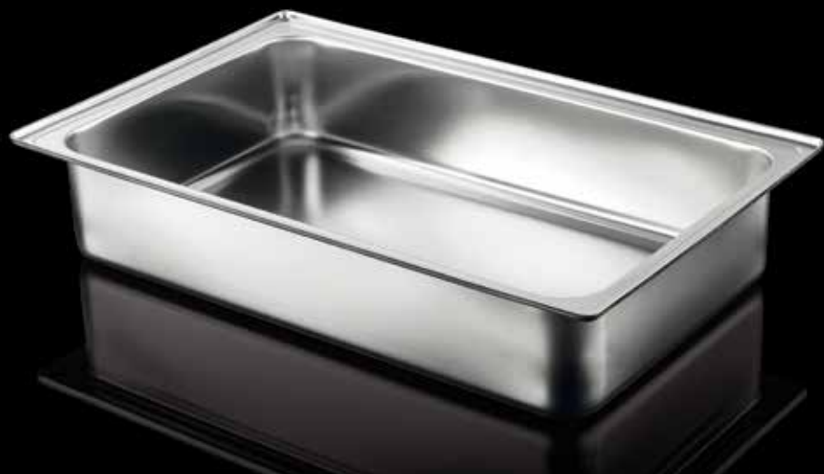
CHAFING DISH 1/1