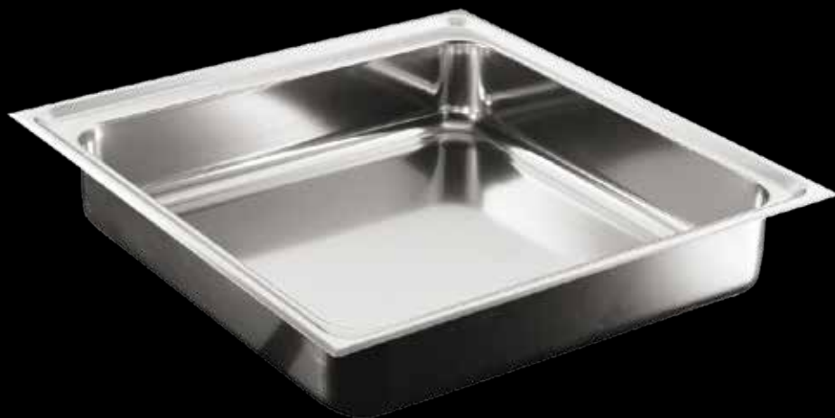
FRY TOP 1 1/2