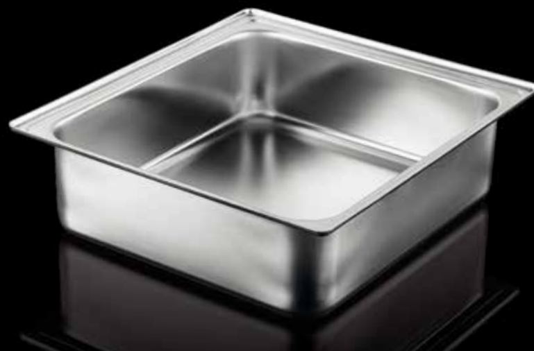
CHAFING DISH 2/3